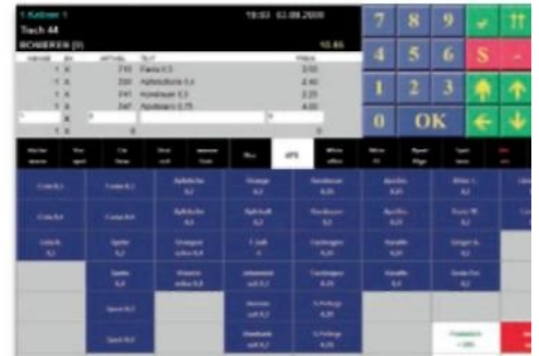
Ringing up mask (64 item alloc. per selection)