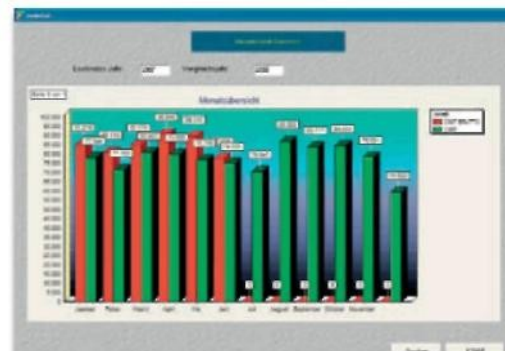
Add-on module: GastroControl