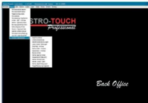
Back office / Administration